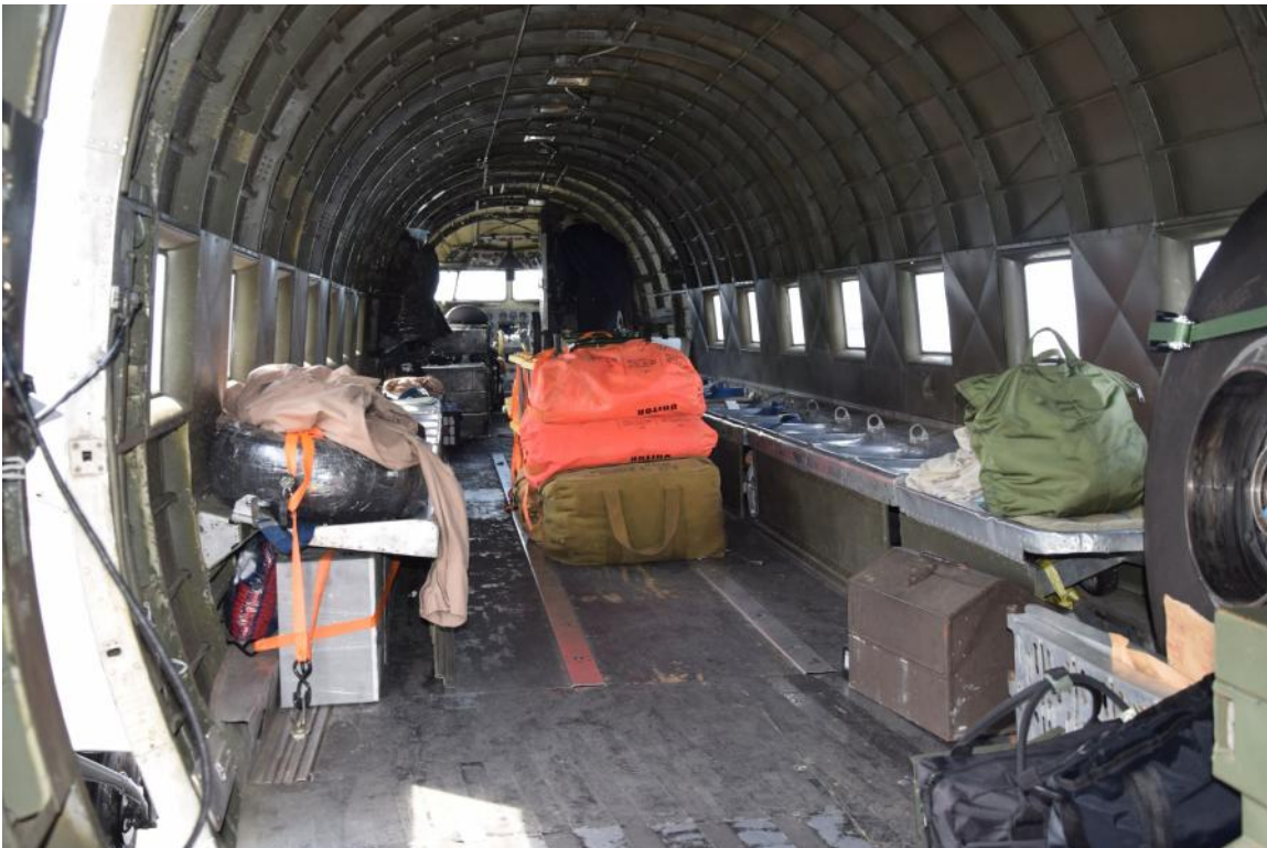
Ready for the jumpers