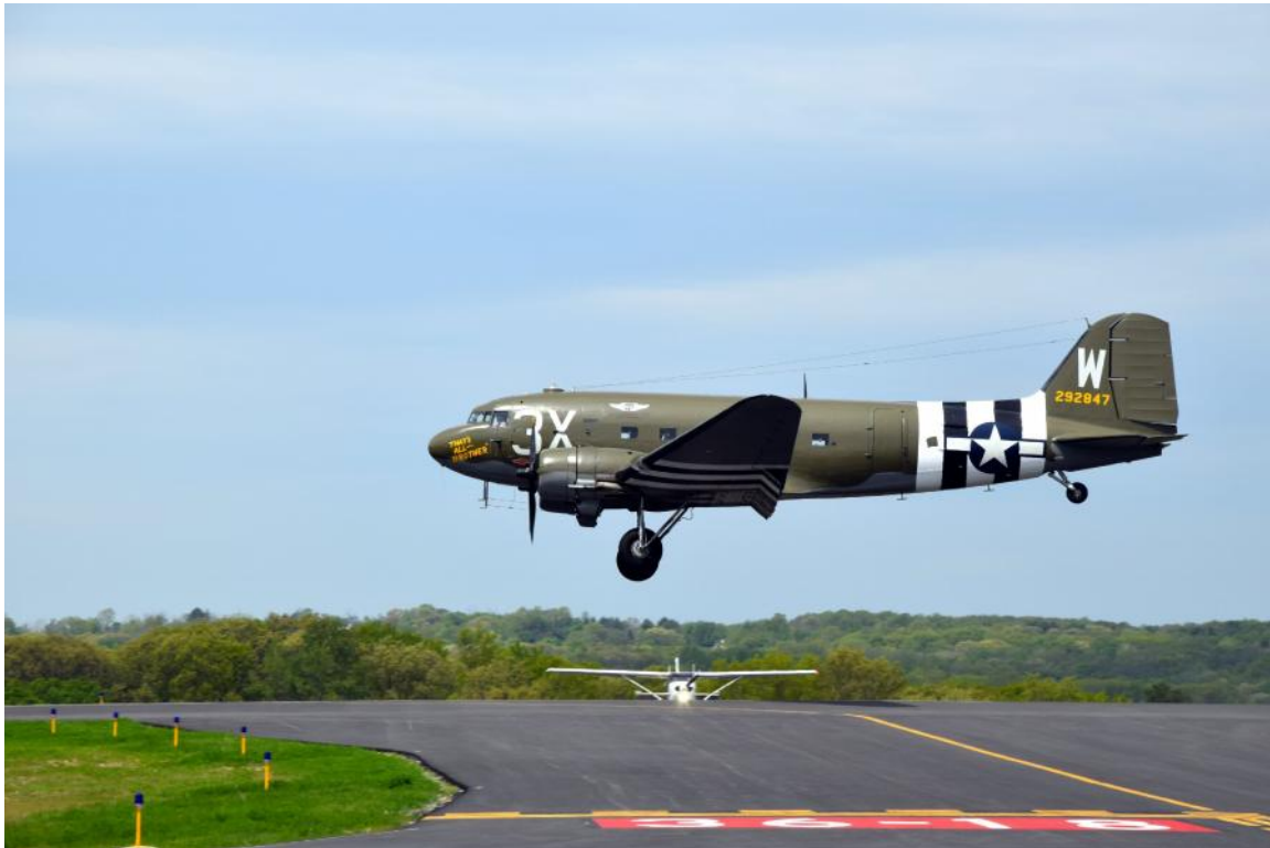
Coming in for a landing