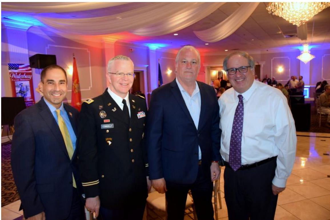
A few of the distinguished guests